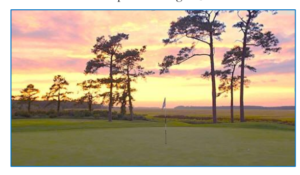
Sunset dinner special every Wednesday from 6 to 8:30

Thursday Drink Specials Beers on tap $1.50 House liquor $3.00 House pour starting at $3.00